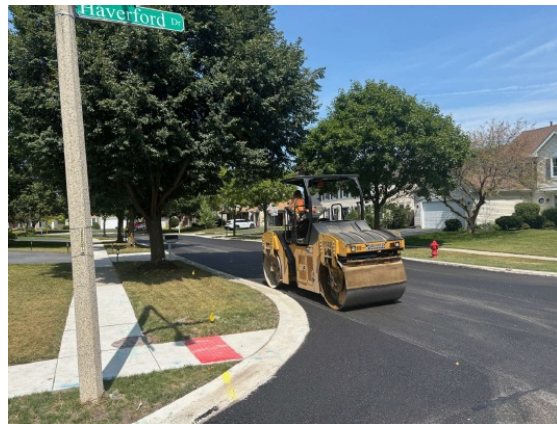
The images above show paving the hot-mix asphalt binder in the Stage II area