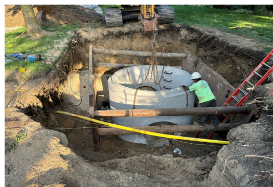
8 ft. diameter manhole at Cloverdale