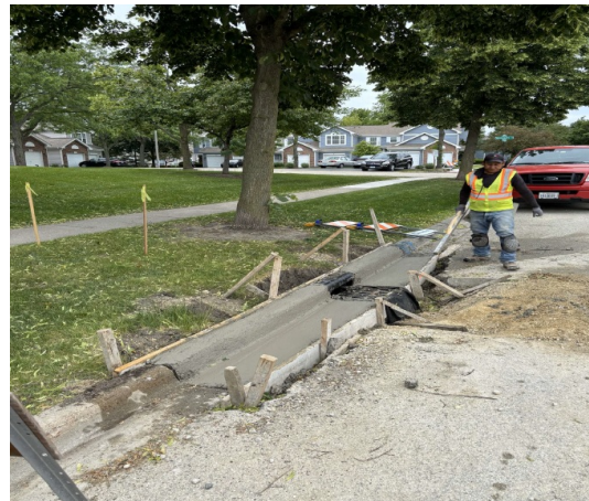
Sidewalk and curb concrete pour