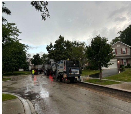
HMA milling on Stage I