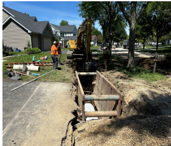
Storm sewer installation