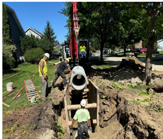
RCP pipe installation