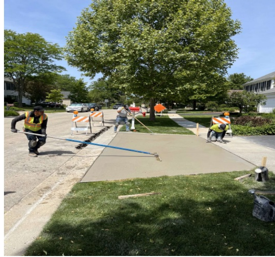
Driveway apron pouring in Stage II

Upcoming work for this area includes continuing the removals, framing, and pouring the new concrete for curb and gutter, sidewalk, and driveway aprons at various locations on Dorchester Avenue, Fernwood Court and Wynnfield Drive.