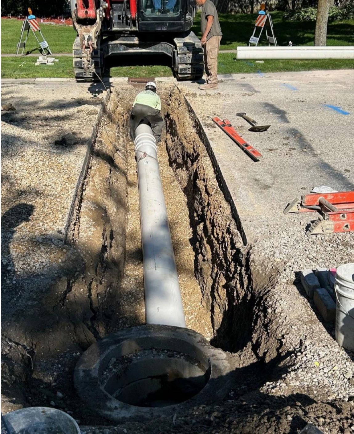
Installing Storm Sewer Improvements in Stage II