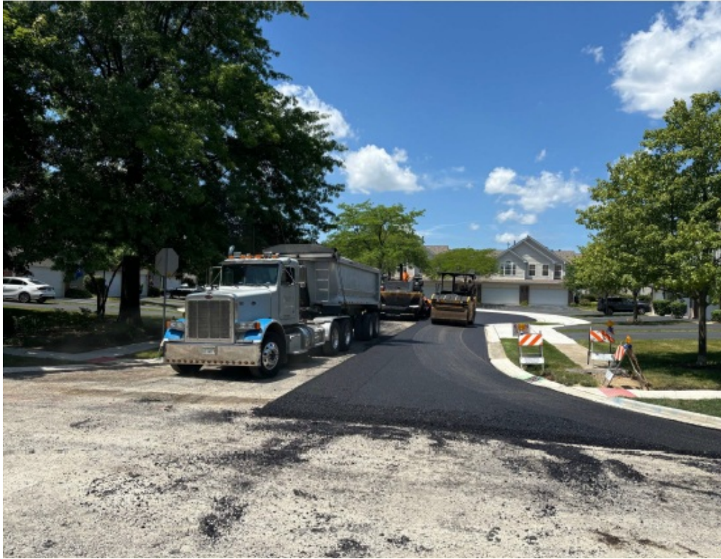
Paving HMA Binder Mix in Stage I