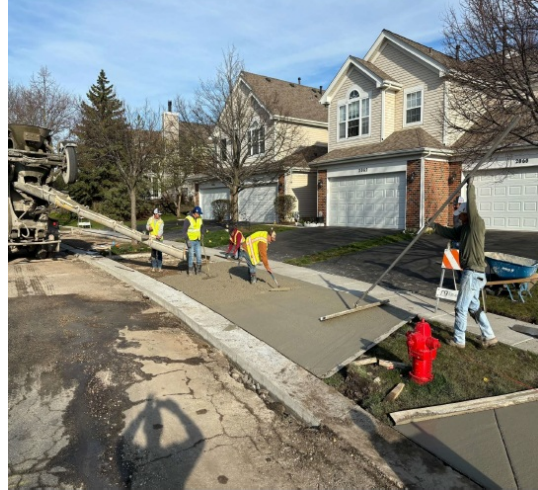
Driveway apron being installed