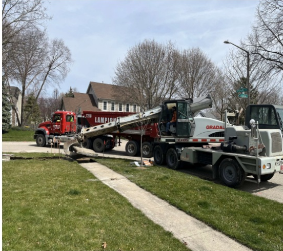
Sidewalk and curb removal

All concrete items are anticipated to be completed this week. The Village will continue to communicate all driveway access impacts with residents.